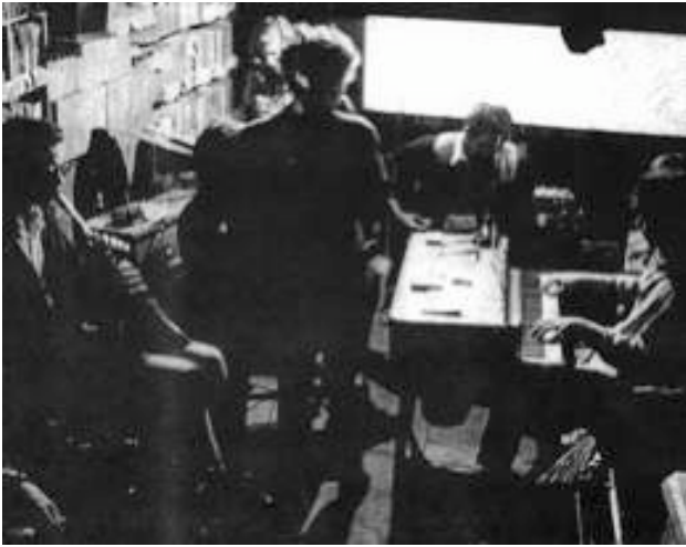
Applejack Blues Band rehearsing in basement of Jazz Record Mart circa 1966