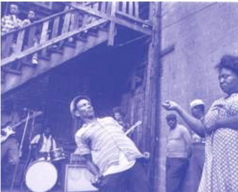
Little Nick Trio, Applejack on bass (behind dancing man) on Maxwell Street, circa '64-65.

(pictures below are from the Chicago era)