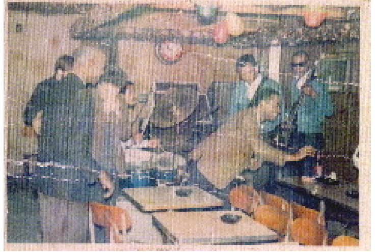
gig at Theresa's Tavern, on the south side. circa 1966